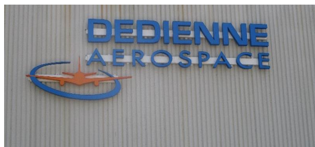
Dedienne Aerospace, Clermont County