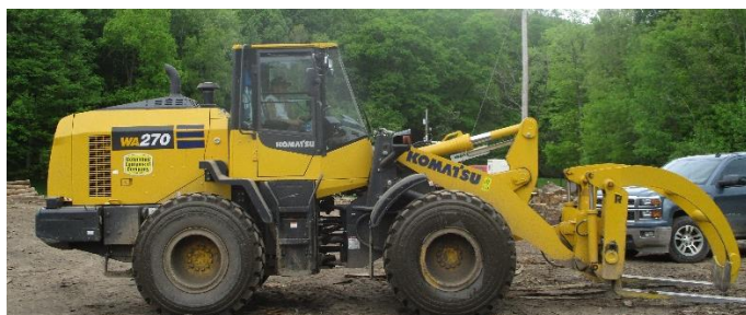
Woods Lumber, Adams County

Economic Development program provides grants for projects that will create, retain or