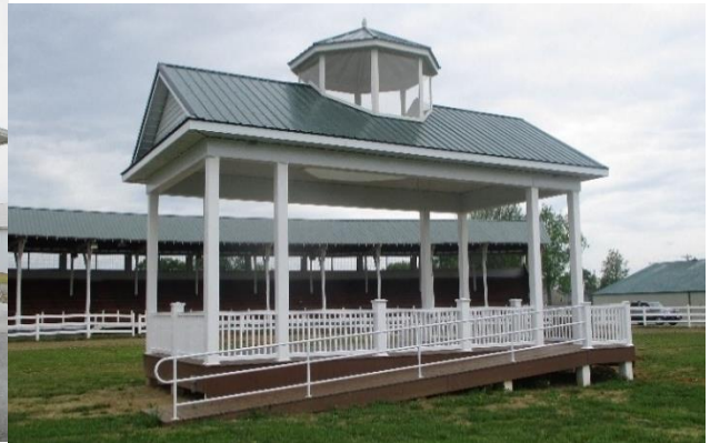
Adams County Ag Society

"I can speak for the whole fair board when I say thank you for awarding us this grant. Our rabbit and poultry barn has been out dated and the grant off set the price of a new up to date barn that we needed. Our board members, exhibitors, and fair goers were all very happy with the new barn!"