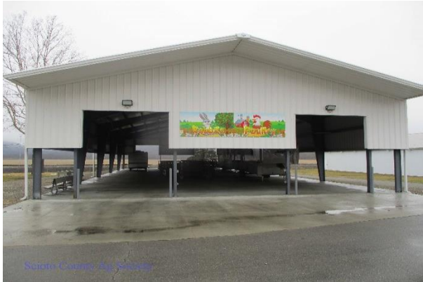
Scioto County Ag Society

completed. In FY 19, SOACDF has currently issued $100,000 to county agricultural societies to help with permanent improvements to county fairgrounds.